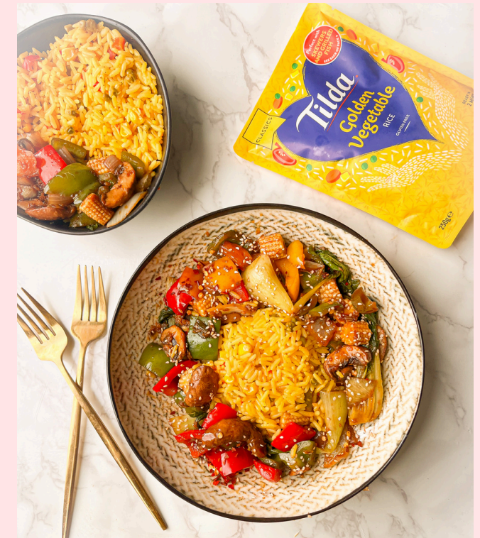
Brand features, partnerships and collaborations..