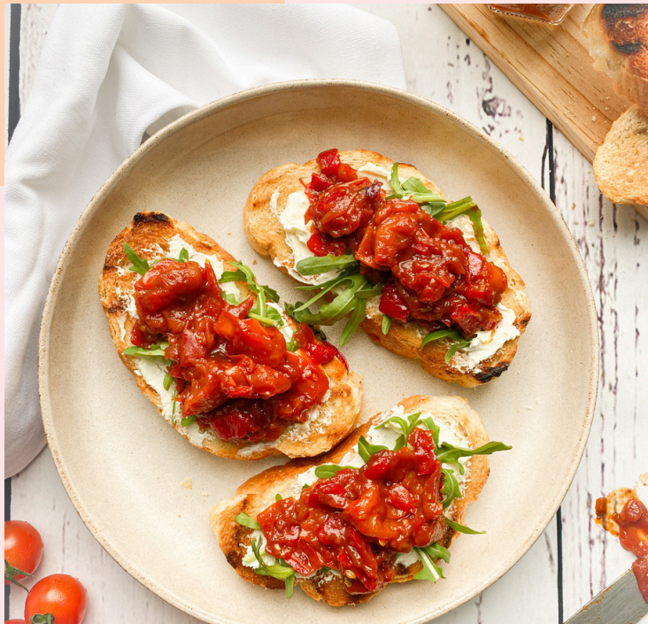
Brand partnership with The British tomato association